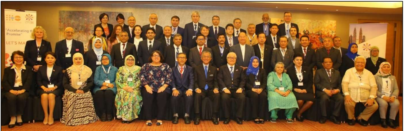
Participating Members of Parliament, NC officers, representatives of International Organizations and experts in the 31 st Asian Parliamentarians' Meeting on Population and Development