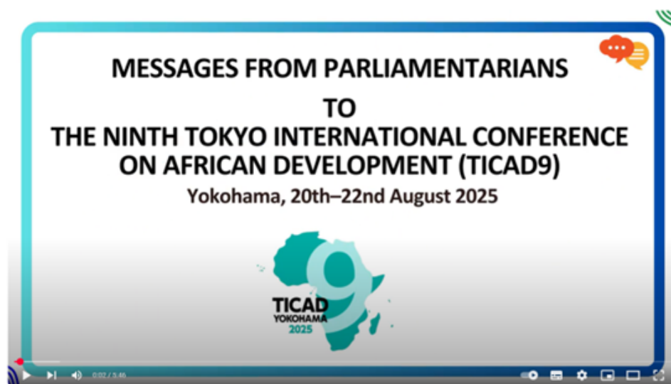
A video message toward TICAD9

Currently, Hon. Dr. Abdul-Rashid Hassan Pelpuo, Chair of GPCPD and Minister of Labour, Jobs, and Employment of Ghana, serves as President of FPA and is leading its activities.