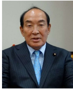
Hon. Yukio Ubukata