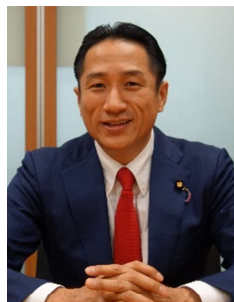
Hon. Ryuhei Kawada