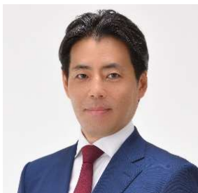
Hon. Tatsuo Fukuda