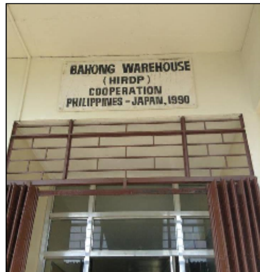
A warehouse written that "(HIRDP: Highland Integrated Rural Development Project) Cooperation Philippine-Japan, 1990"